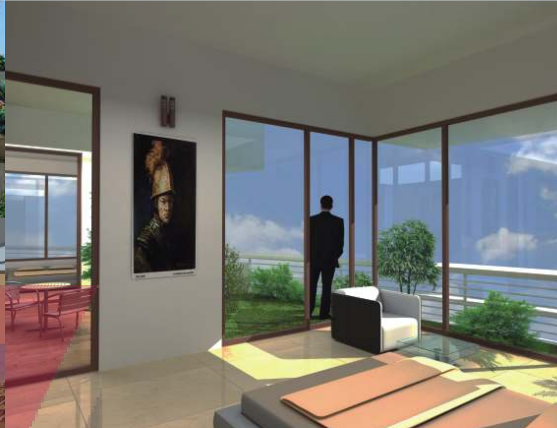
Artists impression of personal verandah with lawn