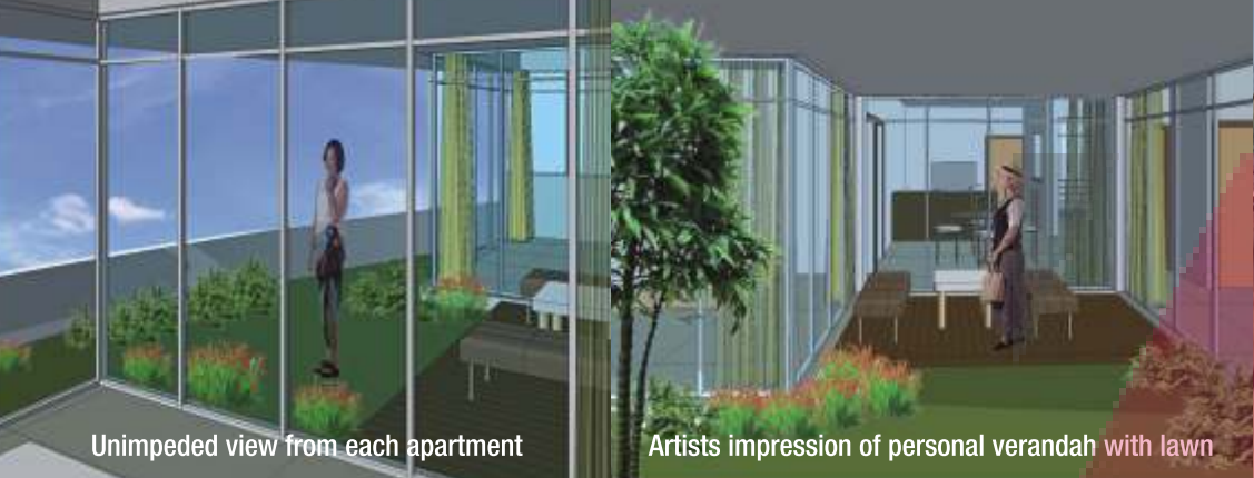
Unimpeded view from each apartment